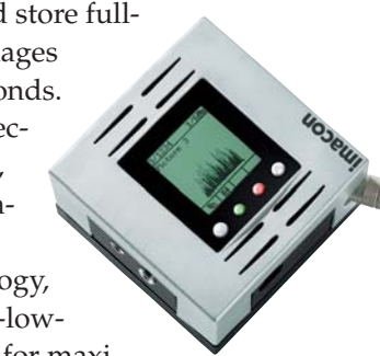
IMAGE BANK The Ixpress image bank

With its 16-million pixels and 9-micron pixel size, the Ixpress Digital Back is state-of-the-art in high-end digital capture. Whether connected directly to a computer or to its own Image Bank for computer-free operation, you can shoot and store full-resolution images every 1.5 seconds. Advanced electronic design, featuring Imacon's unique DDC technology, ensures ultra-low-noise images for maximum clarity, density and dynamic range with true 16-bit color resolution.