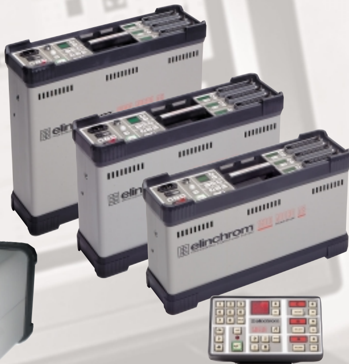
19325 JR Remote Control